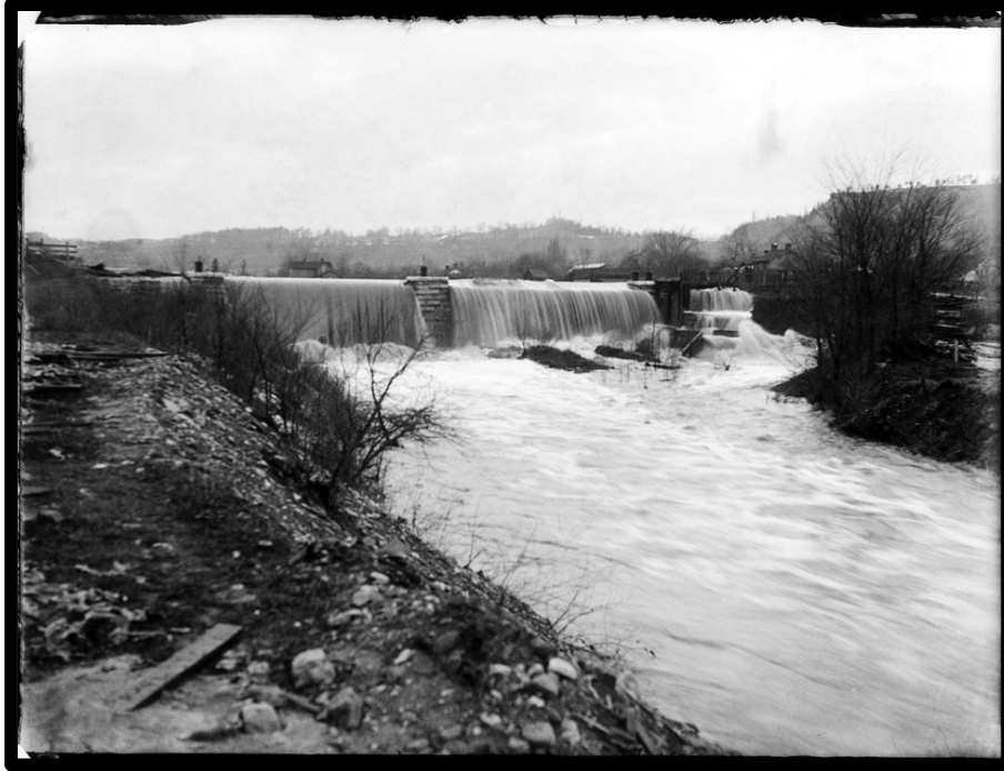
Ewart's Dam (GN-0262)